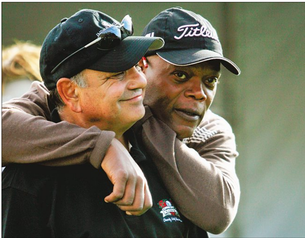
Samuel L. Jackson and Cheech Marin hang out Wednesday, the first day of the Bob Hope Chrysler Classic in La Quinta, before teeing off at the 10th hole of SilverRock Resort.